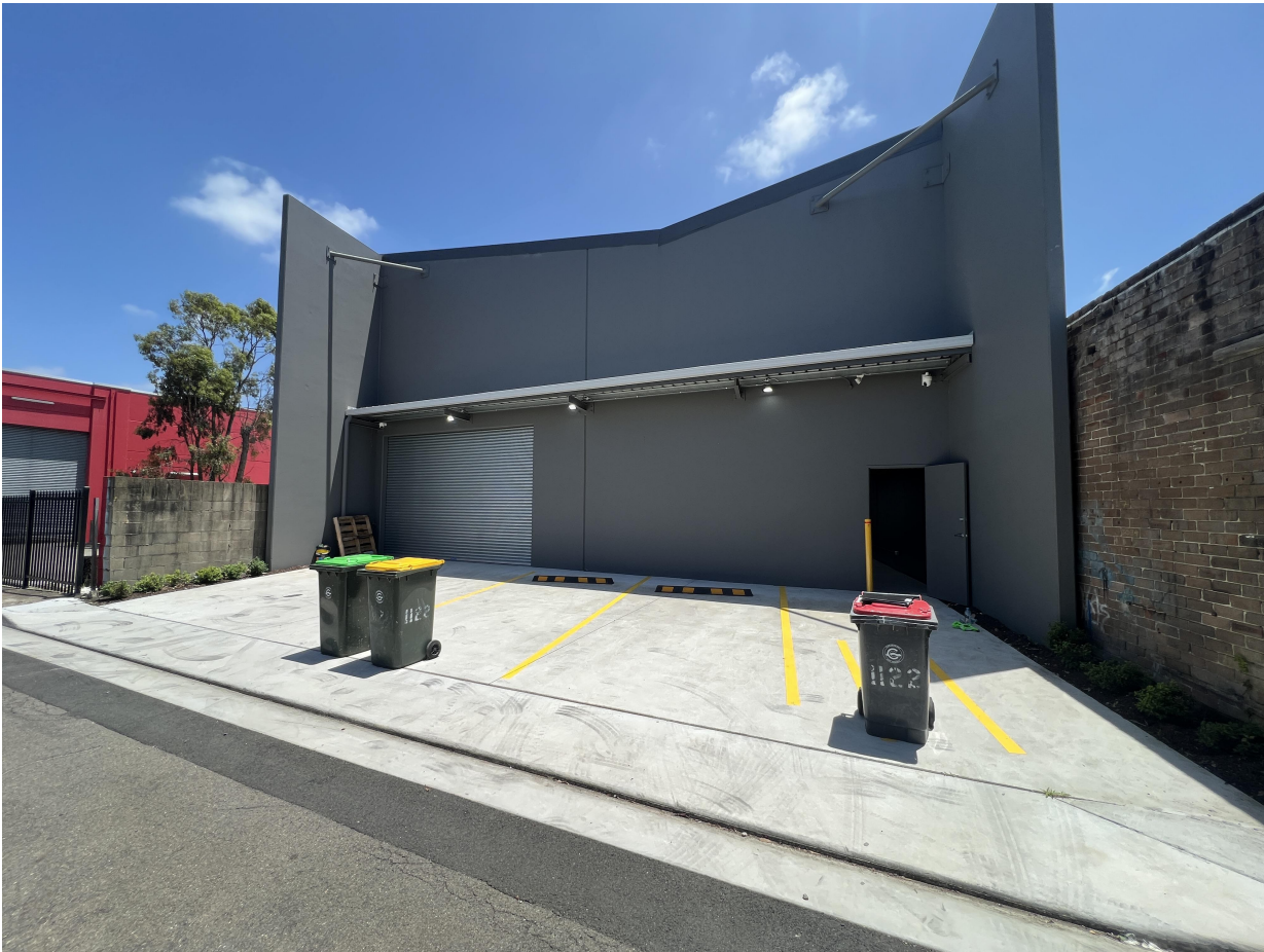
View 3 (Rear)