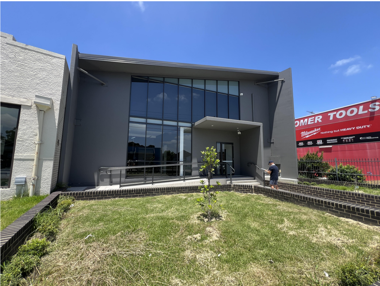
View 1 (Front)