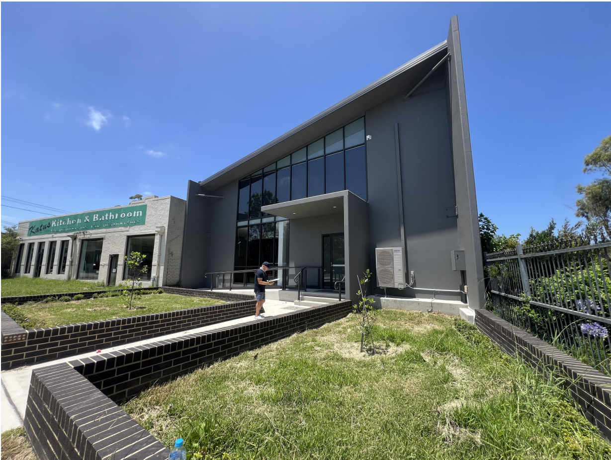
View 4 (Front)

JOHN SPITERI DESIGN AND DRAFTING ABN: 12546 685 338 EMAIL: johnspiteridrafting@gmail.com BUS PH/FAX: 02 9349 6422 MOBILE: 0419 412 299 (C)