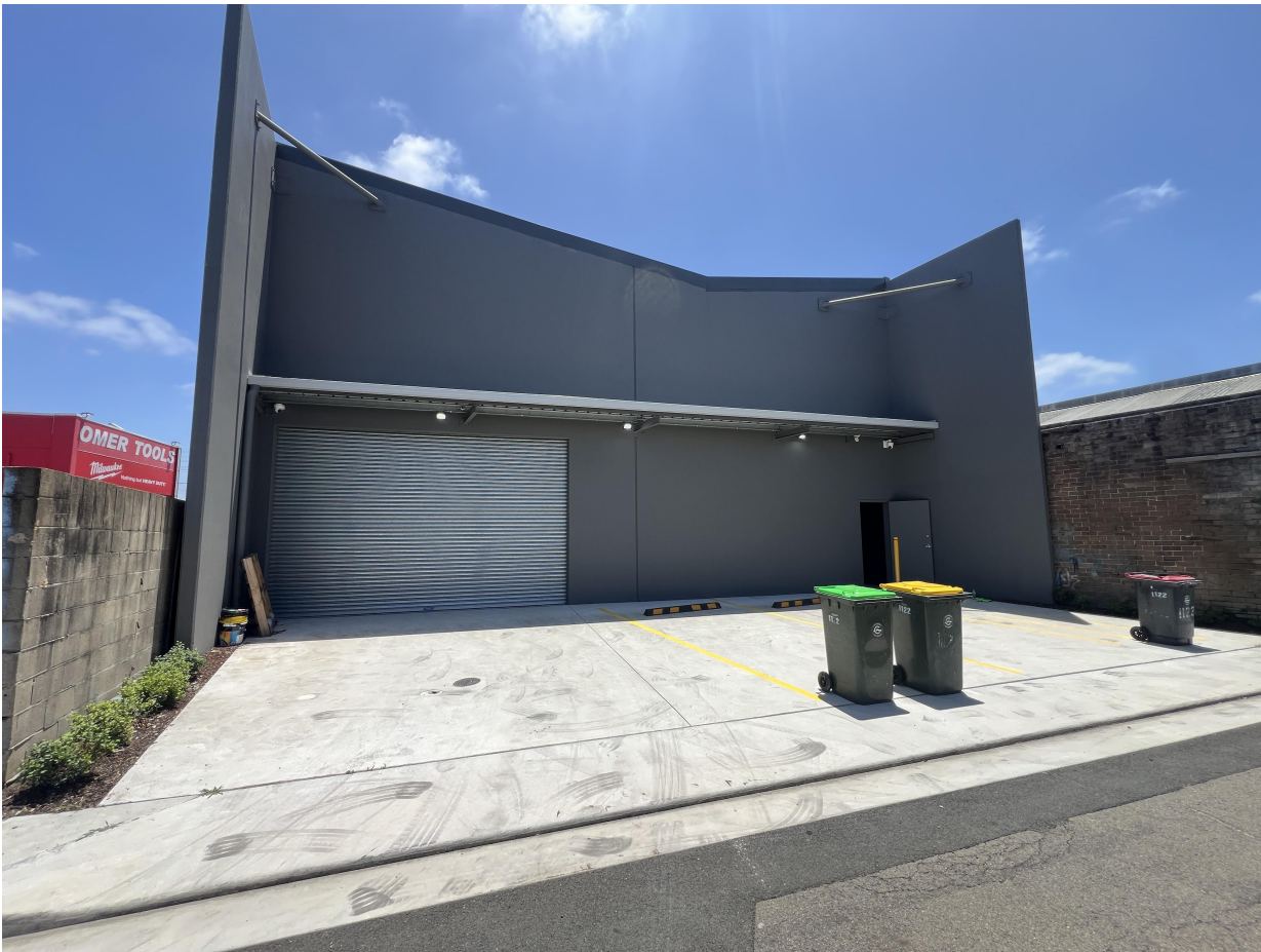
View 2 (Rear)